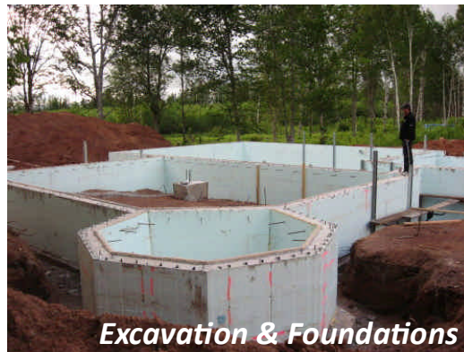
Excavation & Foundations